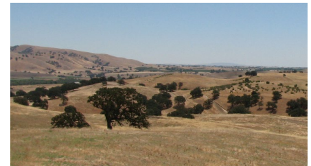
Camp Roberts offers flexible training sites for live-fire exercises (top), and preserves open grazing lands and other agricultural lands that surround the camp (bottom).