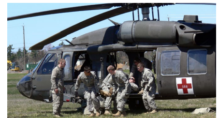
Soldiers at Fort Drum prepare for deployment to combat zones (top and bottom).