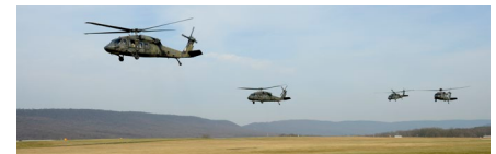
Fort Indiantown Gap hosts multiple ground-based training activities such as joint armored war fighting exercises (top), and multiple aviation-related training activities (bottom).