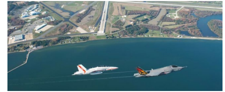
NAS Patuxent River and the Atlantic Test Ranges serve as an important flight testing site.