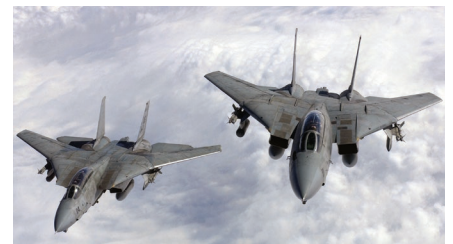
An F/A-18 Hornet performs a touch-and-go landing at NAS Oceana (top). F-14 Tomcats flying in support of the mission in Iraq (bottom).