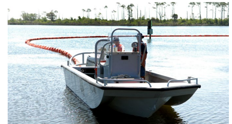
The Blue Angels demonstration squadron performs a maneuver over NAS Pensacola (top). In 2010, the air station deployed a pollution response unit to protect the environmentally sensitive grass beds from the Deepwater Horizon oil spill (bottom).