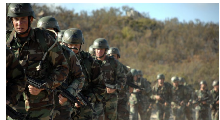
Navy SEALs spend two weeks training in special warfare at Camp Michael Monsoor before earning their qualification (top and bottom).