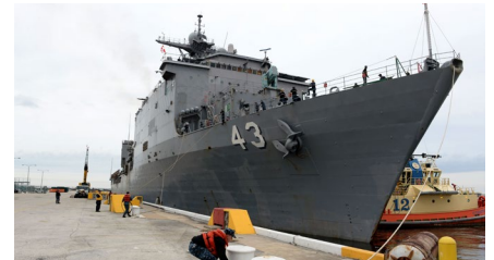
Sailors aboard the amphibious assault ship USS Iwo Jima (LHD 7) heave mooring lines during a sea-and-anchor detail at NS Mayport (top). USS Fort McHenry (LSD 43) docked at NS Mayport (bottom).