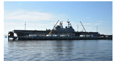
Constructed wetland green infrastructure project at NWS Earle to increase stormwater capacity (top). USS Iwo Jima loading ordnance before deployment (bottom).