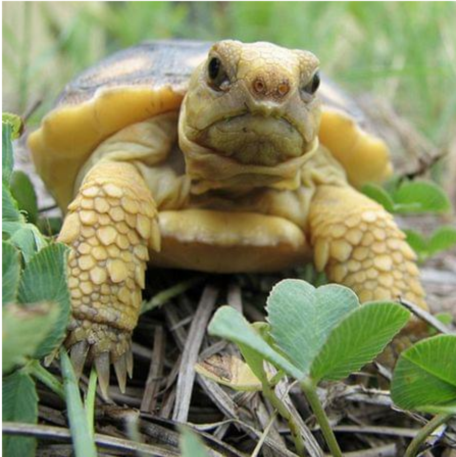
A baby gopher tortoise affectionately referred to as "Bob".

The roar of a distant jet soon punctured the country calm. Moody Air Force Base, and its squadron of A-10 "Warthogs," is 50 miles away. Moody could, conceivably, partake in the tortoise credit strategy. The Army, though, with Forts Benning and Stewart, each about 125 miles from Alapaha is a better bet.