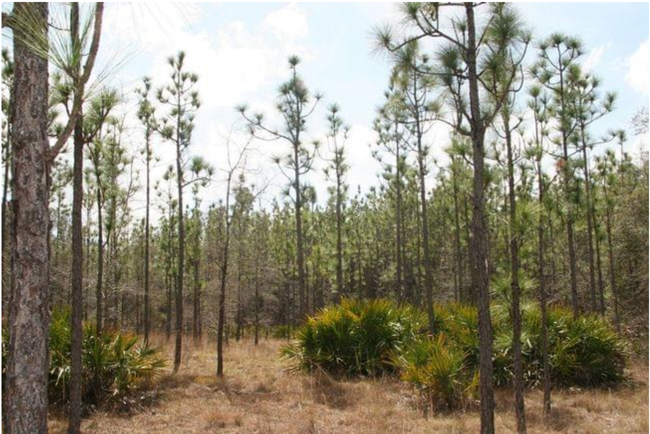
An open pine stand at the Alapaha WMA provides habitat for gopher tortoise. Photo by Roy Hewitt, USFWS>

The Service unveiled a range-wide conservation strategy for the tortoise in 2013. The tank-like critter, with powerful legs and Yoda-like visage, is threatened by tree farms, urbanization, phosphate and sand mining, disease, coyotes, wild boars and loss of longleaf pine stands and their controlled burns that nourish the tortoise's ecosystem.