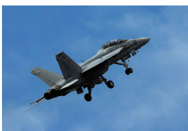
A U.S. Navy F/A-18F Super Hornet aircraft conducts a routine training evolution above the Navy Dare Bombing Range in Dare County, N.C.

The Marine Corps will use $5.8 million of the REPI Challenge award to leverage funding from the North Carolina Wildlife Resources Commission to establish an easement and support management of over 12,100 acres of state-owned land for RCW habitat. The Bear Garden project, in conjunction with other initiatives, will enable Marine Corps Base Camp Lejeune to expand lands dedicated to RCW recovery, reduce the installation's RCW recovery goal, and provide flexibility and capacity to infantry training at the base. This effort will help resolve a significant number of habitat-related training challenges for the foreseeable future. This project will help promote conditions necessary to proceed with the development of new training ranges, expansion of ship-to-shore exercises, and enhancement of tactical tank maneuver areas, as well as ensure operational training realism on the base's main side and in the Greater Sandy Run Area.