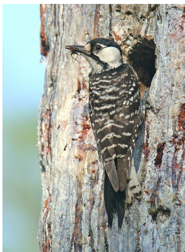
Habitat for the endangered red-cockaded woodpecker can be found on Marine Corps Base Camp Lejeune and other military installations.

Over the past 6 years, the REPI Challenge has provided benefits across 12 locations that have resulted in leveraging $37 million in REPI funds with $117 million in partner contributions, to protect nearly 110,000 acres of working lands, habitat, and open spaces.