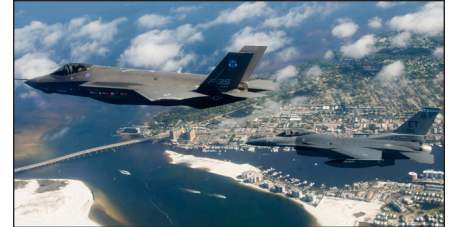
Eglin Air Force Base supports training for the new F-35 Joint Strike Fighter.

In its second year, the 2013 REPI Challenge revealed over $117 million of new partner funding for over 158,000 total acres of executable land acquisition opportunities at a total cost of over $206 million around 19 installations in 16 states. As the 2013 proposals showed, the REPI Challenge is helping to change the scale and practices of land conservation supported by the REPI program.