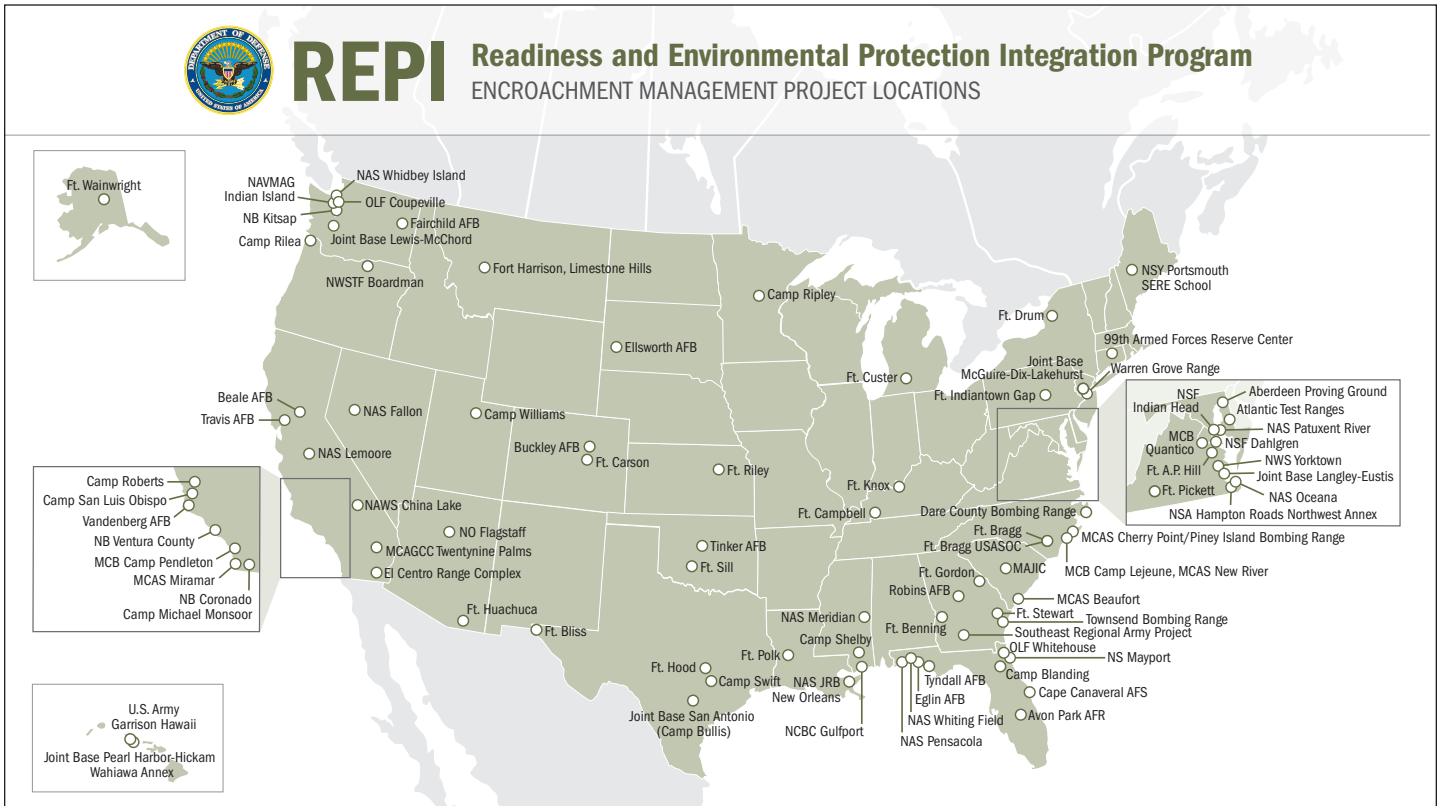
The map above shows REPI projects through FY 2016 at 89 locations in 30 states across the country.