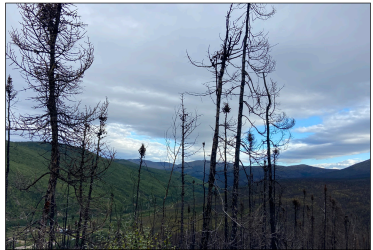
Alaska Black Spruce post-fire, Tanana Flats, Alaska.