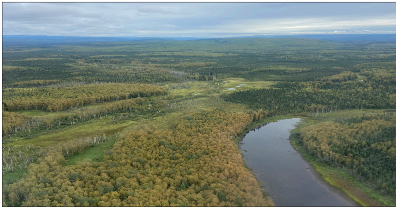
Chena River, Alaska.