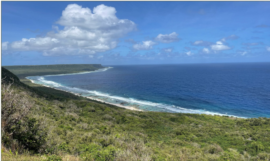
Limestone forests along northern coast of Guam.

The Mariana Archipelago, comprised of Guam and the CNMI, is home to several DOD installations and annexes whose missions align closely with National Defense Strategy priorities. Facilities within the Marianas include Naval Base Guam, Andersen Air Force Base, Marine Corps Base Camp Blaz, and the Military Lease Area on Tinian. These critical missions face pressure from continued development, impacts of extreme weather events, decline of threatened, endangered and at-risk species, and degradation of important habitats. The REPI Program is working alongside the Government of the CNMI, the Government of Guam, Federal agencies, and NGOs to implement the conservation and restoration of native ecosystems and the preservation of cultural resources. In turn, these efforts will reduce or alleviate potential constraints and ultimately build community resilience.