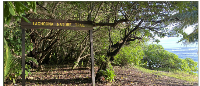
Tachogna Nature Trail Entrance, Tinian.