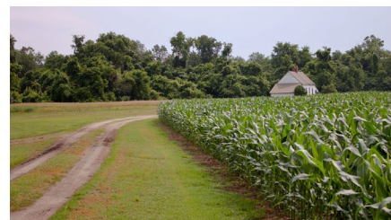
Marine Humvees conducting training exercises (top). Camden Farm, preserved through REPI (bottom).