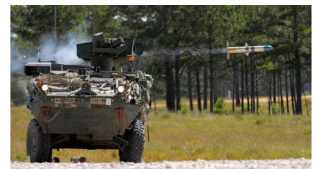
A Chinook helicopter performing an exercise (top) and a Stryker vehicle firing a missile (bottom) at the Joint Readiness Training Center.