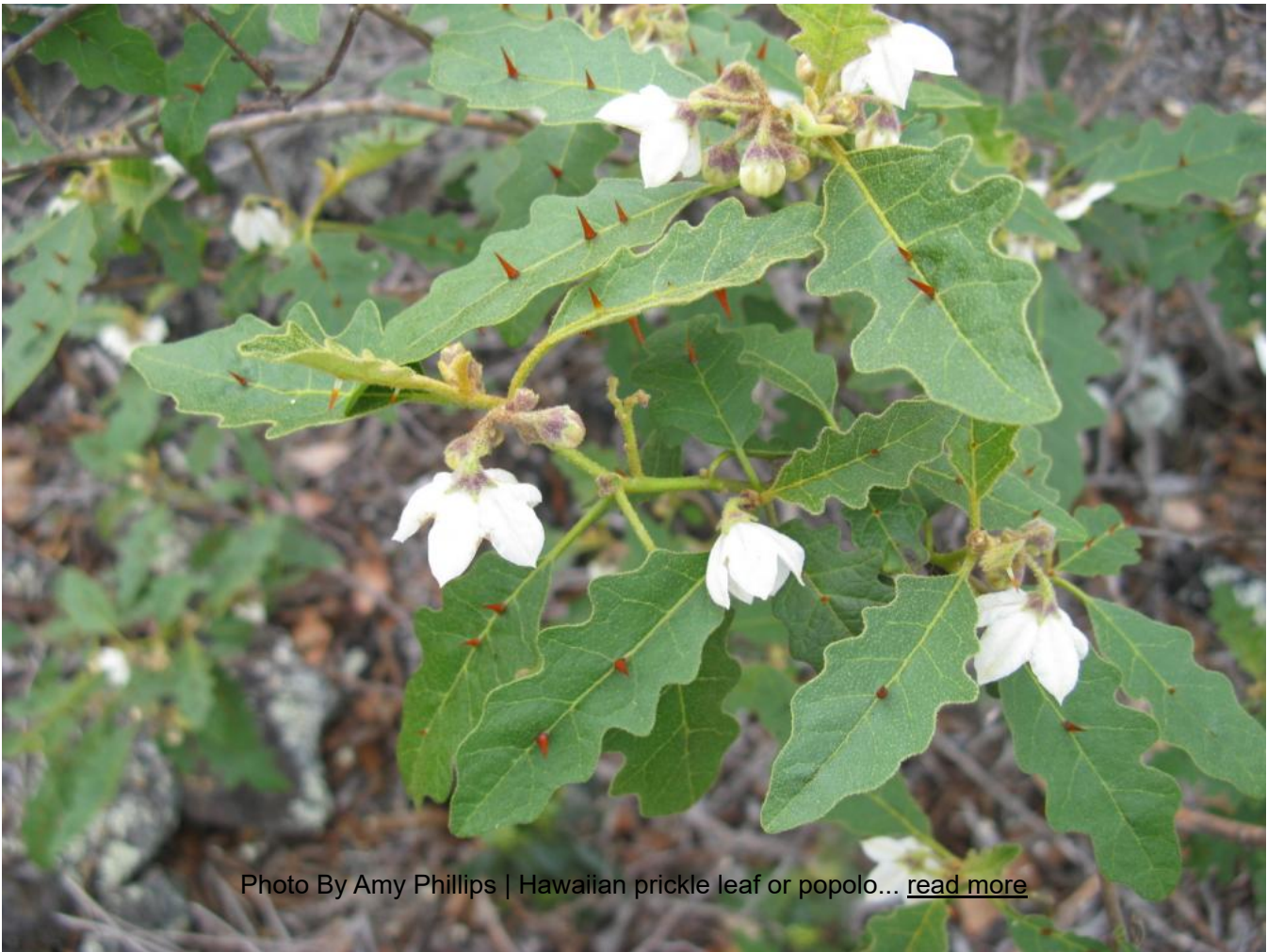
Hawaiian prickly leaf or popolo... read more