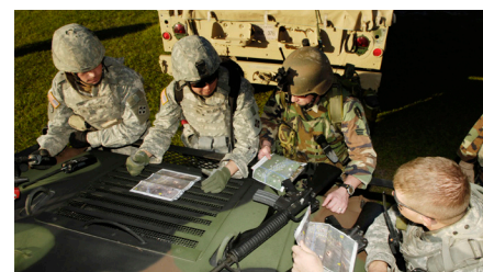
Avon Park AFR hosts exercises that simulate close air support targeting under real urban area conditions (top), and integrated air-ground battle tactics for all Department of Defense Services (bottom).