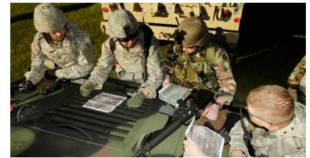
Avon Park AFR hosts exercises that simulate close air support targeting under real urban area conditions (top), and integrated air-ground battle tactics for all Department of Defense Services (bottom).