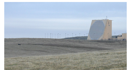
A dedicated crew provides maintenance for the RQ-4 Global Hawk, an unmanned aircraft (top). The preserved open space around PAVE PAWS allows local ranchers to use the land for grazing (bottom).