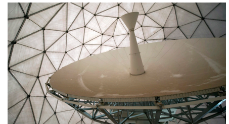
A Colorado Air National Guard F-16 Fighting Falcon takes off over the Denver skyline at Buckley (top). In addition to supporting its aviation mission, Buckley’s REPI partnership protects line of sight for satellite dishes used for defense, intelligence, and space missions (bottom).