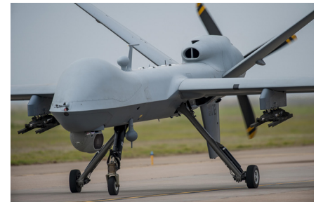
The New Mexico landscape provides an optimal training environment for aircrews operating aircraft such as the MC-130J Commando II (top) and unmanned aerial vehicles such as the MQ-9 Reaper (bottom). Airmen and women of the 27 th Special Operations Wing are able to test and train on these aircraft and others at Cannon AFB.