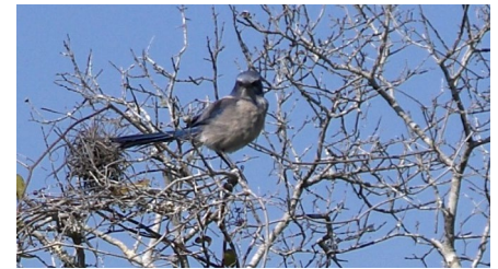
Preserving habitat for the Florida scrub-jay (bottom) helps preserve the mission at Cape Canaveral Space Force Station (top).