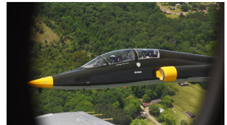
The 14 th Flying Training Wing at Columbus AFB is focused on training world class pilots and providing specialized training in the T-6 Texan II (top), T-38C Talon (bottom), and T-1A Jayhawk aircraft.