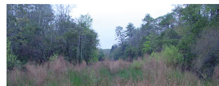
A F/A-18 Super Hornet conducts a routine training exercise above Dare County Bombing Range (top). The range includes forested wetlands and other habitat (bottom).