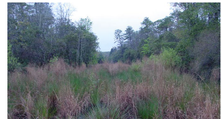
F-15E dropping inert ordnance (top). The range includes forested wetlands and other habitat (bottom).