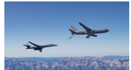
The 412 th Test Wing's mission includes the operation and maintenance of the B-1B Lancer and the KC-46 Pegasus, picture above flying over Edwards Air Force Base, California.