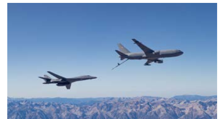
The 412th Test Wing’s mission includes the operation and maintenance of the B-1B Lancer and the KC-46 Pegasus, picture above flying over Edwards Air Force Base, California.