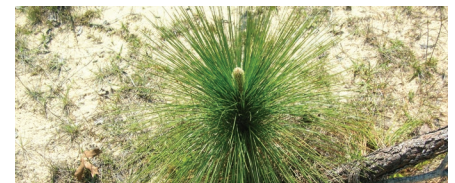
Eglin AFB is home to Joint Strike Fighter training for Air Force pilots as well as maintainers from the Air Force, Navy, and Marine Corps, requiring open space for low-altitude maneuvers (top). REPI projects support Longleaf Pine habitat (bottom).