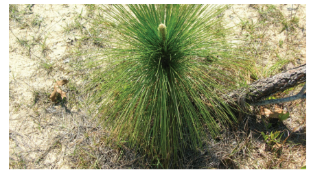
Eglin AFB is slated to become the new home of the Joint Strike Fighter, requiring open space for low-altitude maneuvers (top). REPI projects support Longleaf Pine habitat (bottom).