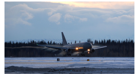
Aircraft assigned to the 354th Fighter Wing and 168th Wing park in formation on Eielson AFB (top). Due to Eielson AFB’s location, the base hosts many visiting aircrews that come to conduct cold-weather training, such as the 931st Air Refueling Wing with this KC-46A Pegasus (bottom).