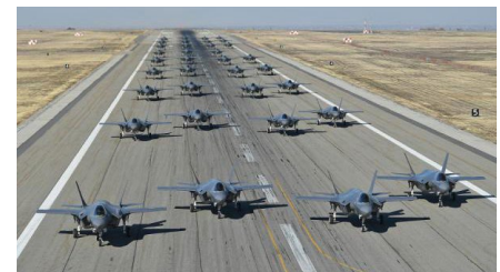
Two F-35s fly over Weber Canyon at Hill AFB (top). F-35s prepare for a combat power exercise (bottom)