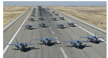
Two F-35s fly over Weber Canyon at Hill AFB (top). F-35s prepare for a combat power exercise (bottom)