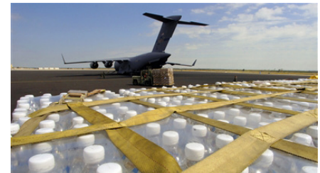
The counter-land, counter-air, and counter-sea training and humanitarian operations at Homestead ARB require airmen and airwomen to be ready for rapid response in the event of any emergency (top). These rapid response times ensure that units are prepared in the event of a national security emergency, humanitarian crisis, or relief effort (bottom).