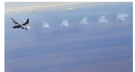
A conservation easement adjacent to Melrose Air Force Range consists of 30,493 acres (top). An AC-130W Stinger II fires its weapon over Melrose Air Force Range, N.M (bottom).