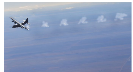
A conservation easement adjacent to Melrose Air Force Range consists of 30,493 acres (top). An AC-130W Stinger II fires its weapon over Melrose Air Force Range, N.M (bottom).