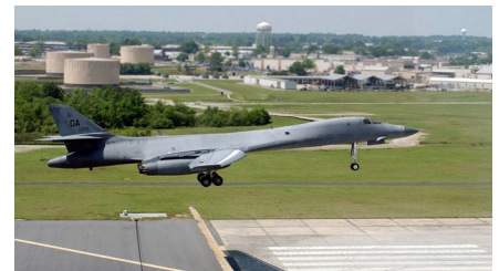
Robins AFB provides depot-level maintenance, such as aircraft repairs and upgrades (top). A B-1B Lancer bomber lands at Robins AFB after a post-maintenance flight (bottom).