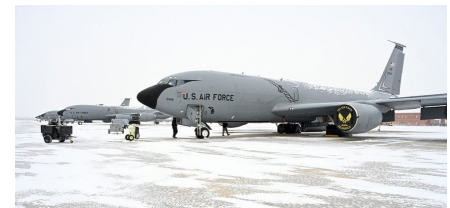
An A-10 Thunderbolt II, operated by the 107 th Fighter Squadron, 127 th Wing, returns to SANGB following a local training mission (top). Airmen diligently maintain KC-135T Stratotanker air refueling aircraft in preparation for training, notably, the 127 th Wing operates around the clock, 365 days a year, regardless of temperature (bottom).