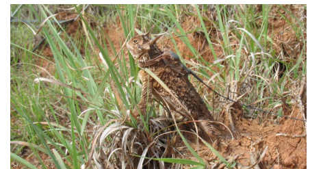
Crew members prepare a KC-135 Stratotanker for an air refueling mission exercise (top). The Texas Horned Lizard is a state sensitive species that is actively managed by the installation (bottom).