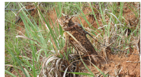
Crew members prepare a KC-135 Stratotanker for an air refueling mission exercise (top). The Texas Horned Lizard is a state sensitive species that is actively managed by the installation (bottom).