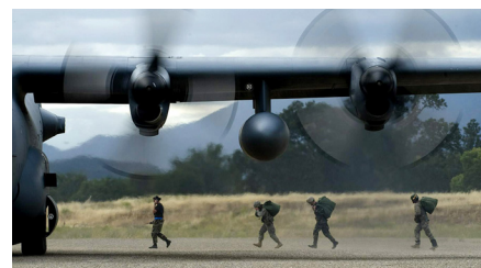
A KC-10 Extender from Travis AFB refuels an F/A-22 Raptor (top). Airmen and Soldiers board a C-130 Hercules aircraft to participate in a training exercise (bottom).