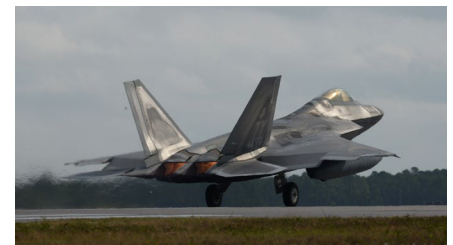
Tyndall AFB's location and access to Gulf of Mexico operating areas allows aviators to utilize unique capabilities, such as realistic aerial target practice against unmanned QF-16 drone jets (top). An F-22 takes off from Tyndall AFB to use this capability and evaluate air-to-air weapons systems (bottom).