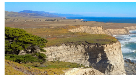
The Delta IV Heavy rocket stands 235 feet tall and is America's most powerful liquid-fueled rocket (top). Photo of Dangermond Preserve (bottom).