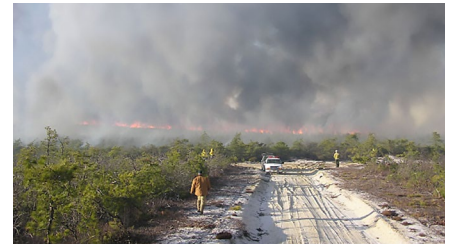
Controlled burns help prevent wildfires, which reduce visibility for air exercises (top and bottom). Bottom photo credit: Dr. Walter Bien, Laboratory of Pinelands Research