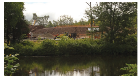
The new Armed Forces Reserve Center serves as a “virtual installation” for Army Reserve soldiers from Maine to Virginia (top). Construction of the new building prompted wetlands mitigation efforts (bottom).