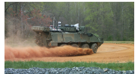
Varied and hilly terrain allows for testing of maneuver vehicles at the Churchville Test Area (top and bottom).