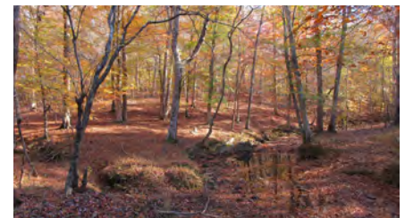
Soldiers compete in annual Sniper Match at Camp Butner (top). Dickens Creek at Camp Butner (bottom).