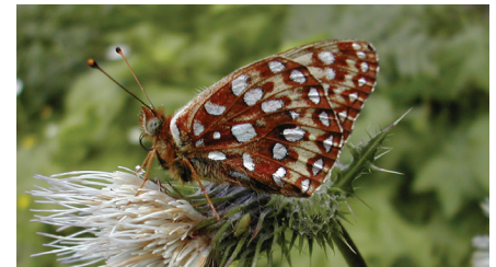
Camp Rilea’s diverse geographies offer training along the Oregon coastline (top), and provide habitat for the threatened Oregon silverspot butterfly (bottom).