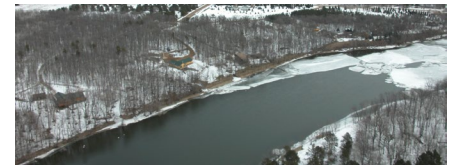
The Crow Wing River (bottom) has been a target for developers, which could interfere with the ability to conduct ground training (top).