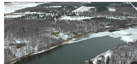
The Crow Wing River (bottom) has been a target for developers, which could interfere with the ability to conduct ground training (top).