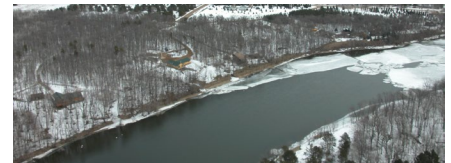
The Crow Wing River (bottom) has been a target for developers, which could interfere with the ability to conduct ground training (top).