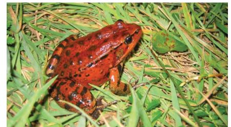
A historical aerial view of Camp San Luis Obispo from 1984 (top). Today, the post provides important habitat for the threatened California red-legged frog (bottom).