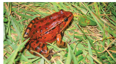
A historical aerial view of Camp San Luis Obispo from 1984 (top). Today, the post provides important habitat for the threatened California red-legged frog (bottom).