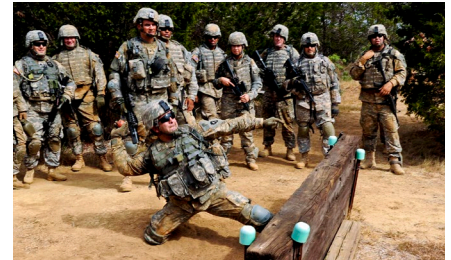
Working lands and buffers protect pre-mobilization training from noise complaints so soldiers can refine basic skills like laying down suppressive fire (top) and launching grenades (bottom).