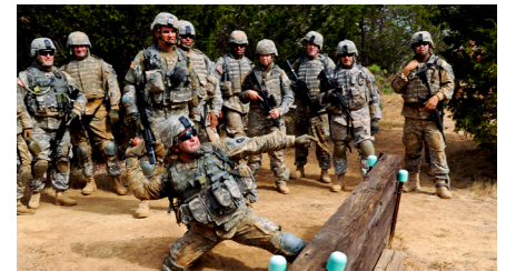
Working lands and buffers protect pre-mobilization training from noise complaints so soldiers can refine basic skills like laying down suppressive fire (top) and launching grenades (bottom).