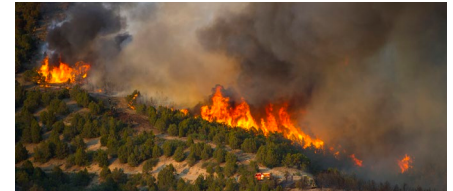
Camp Williams's geography and habitats provide a realistic training environment for ground troops and aviation training (top), but it is also at risk of intense wildfires that halt mission activities and threaten community safety (bottom).