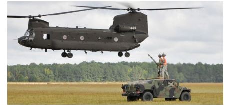
Training at Fort Barfoot includes working in a joint service environment for maneuver (top) and sling load operations, which include rigging a humvee to a helicopter (bottom).