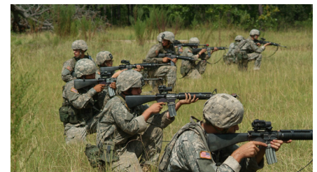
Longleaf pine at Fort Benning provides habitat for threatened and endangered species (top). Soldiers undergoing basic training (bottom).