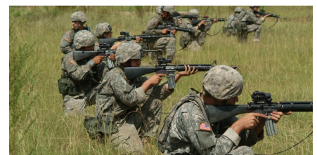
Longleaf pine at Fort Benning provides habitat for threatened and endangered species (top). Soldiers undergoing basic training (bottom).