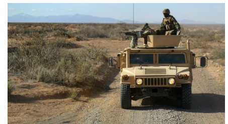
Light pollution and incompatible development can threaten training with vehicles like the Kiowa (top) and Humvee (bottom) for troops that will be deployed to the battlefield.