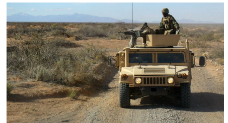
Light pollution and development pressures can threaten training with vehicles like the Kiowa (top) and Humvee (bottom) for troops that will be deployed to the battlefield.