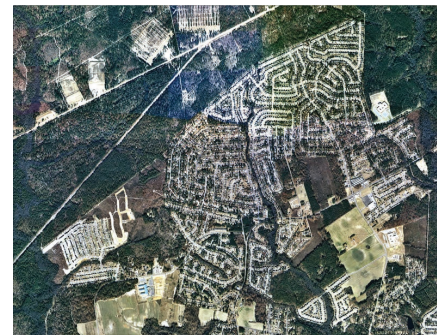
Development adjacent to the installation perimeter.